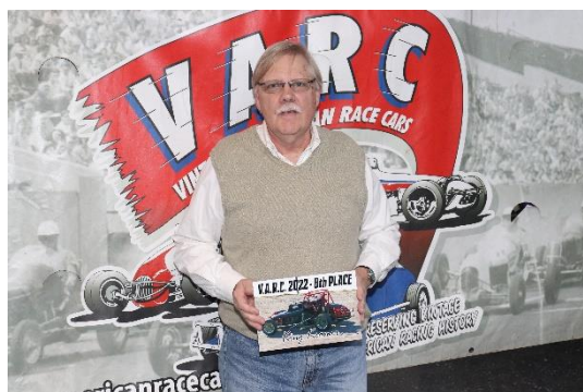
King Kramer 8 th Place