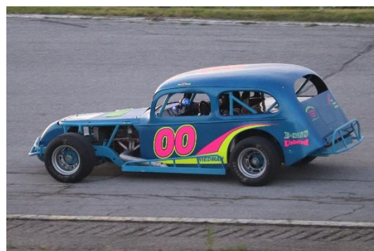
Ton Weidman 8 th Place